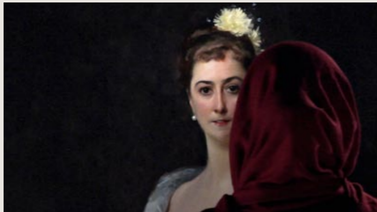
Selected stills from the Video Sightings: The Ecology of an Art Museum , Shimon Attie, 2008.

perceptible distance between viewer and object. This collapse and expansion of visual space creates a hyper-real environment that visualizes the temporal rupture between the object and viewer, which functions as a metaphorical representation of the shifts between knowledge and meaning. At one end of the spectrum stands the viewer characterized by lived experiences and memories that inform the way he/she navigates and interprets his/her surroundings. On the other end lies the object that is rooted by the historical provenance and academic discourse of the institutional archive. By working within a rotational frame, Attie allows the interpretive pendulum to swing from one end of the spectrum to the next.