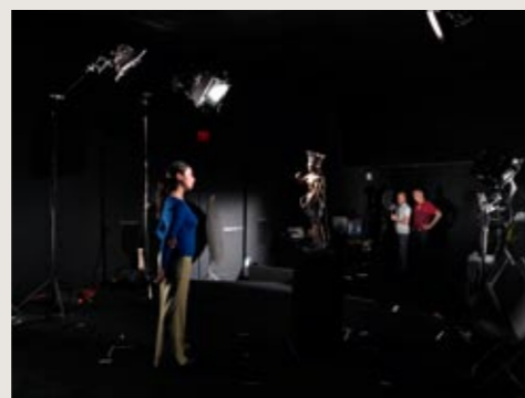
On the set of Sightings: The Ecology of an Art Museum , 2008.