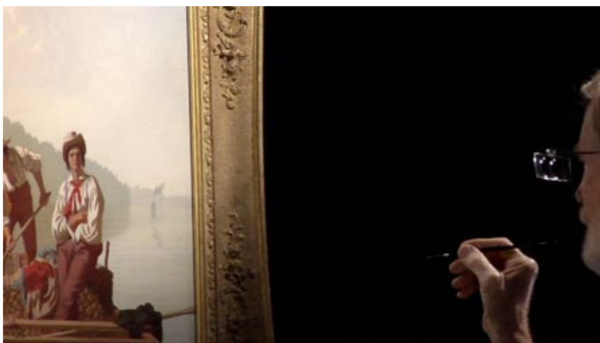
Illustrations: Selected stills from the Video Sightings: The Ecology of an Art Museum , Shimon Attie, 2008.

There has always been an uncanny sensibility in Shimon Attie's photo-based and video artworks. The word "uncanny" derives from the German unheimlich , which refers to the unknown that is strangely familiar, and therefore known in some way after all. In Freudian theory, this paradox—of something one understands without an awareness of its origin or how one apprehends it—lies at the heart of memory, the bringing of something to mind through recall. According to Freud, a sense of the uncanny results when that which is being recalled is unavailable due to repression.